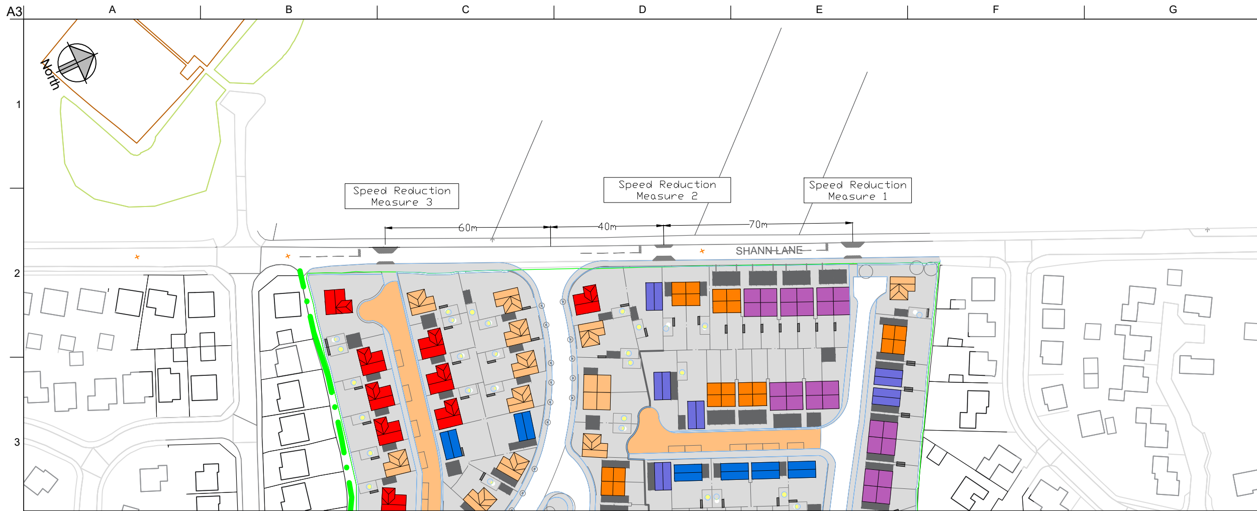
General Arrangement 1:1000