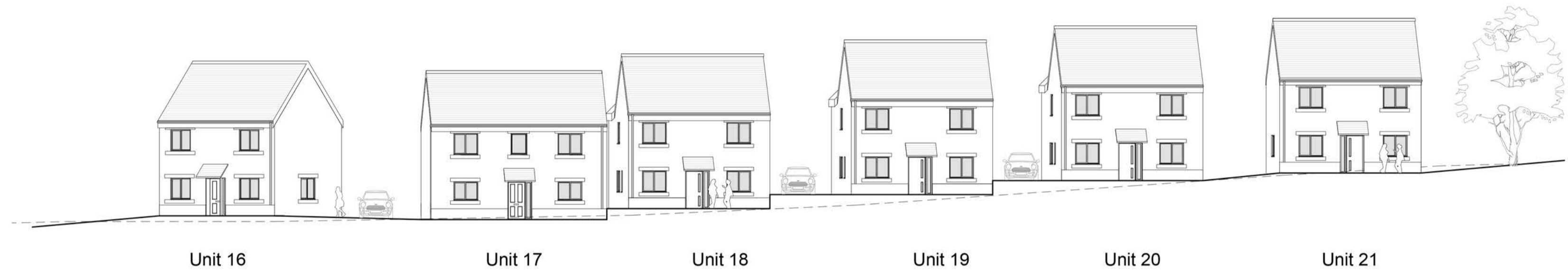
2 Main Highway Proposed Elevation 3 _08_20_06 1:200