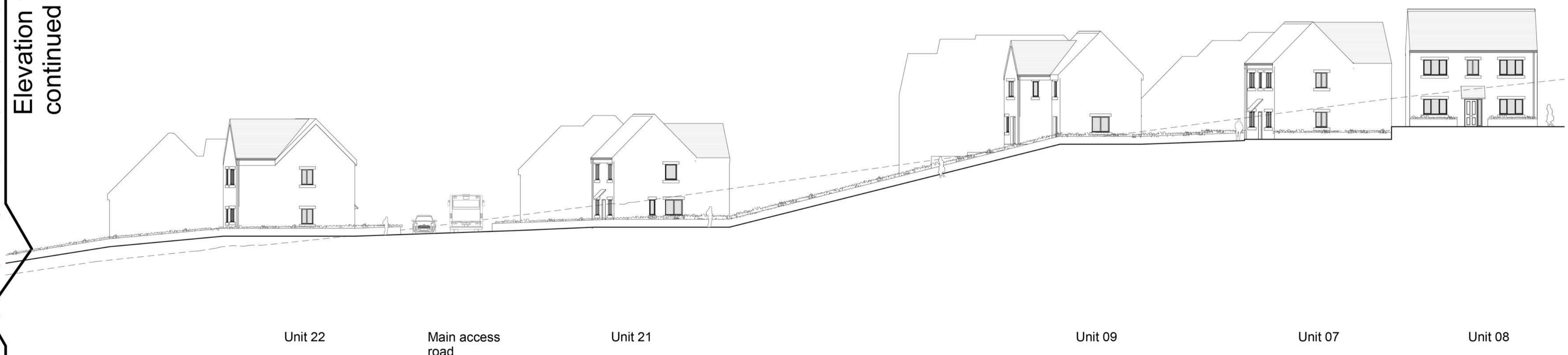
3 Proposed Shann Lane Elevation Continued 08_20_04 1:200