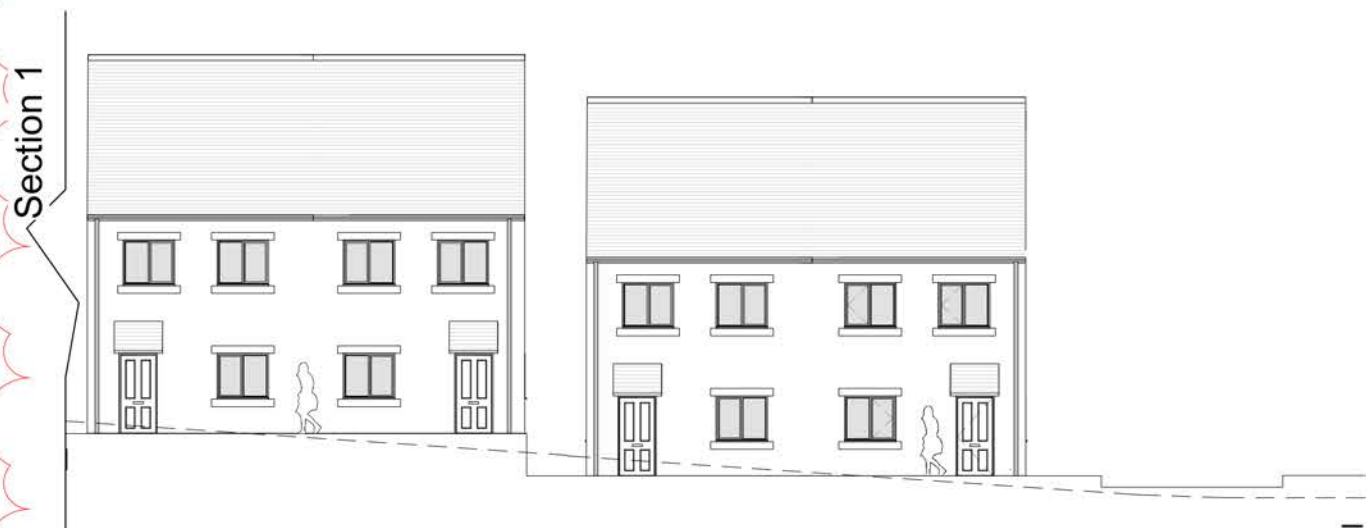
1 Proposed Section 1 _08_20_02 1:200